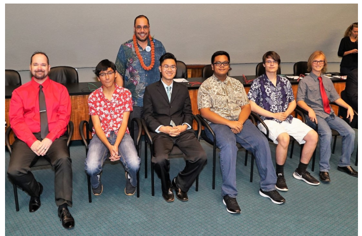
(LEFT) The $355,000 secured this session will expand STEAM libraries throughout the Leilehua Complex. (RIGHT) We congratulated and recognized the Leilehua High School Library Commons on its recent grand opening and the Leilehua High School e-sports team on its successful inaugural season. The Library Learning Commons provides students and faculty with support, tools, and information they will need to successfully learn STEM applications.